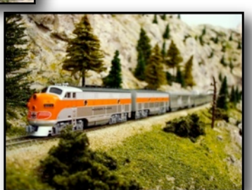
The Western Pacific "Zephyr" climbing the hill to Summit on the N layout during Passenger theme

Pacific Day on December 26. At our theme days you can expect to fine many trains representing that day's theme. It's a good chance to see your favorite trains in operation. The photos show some of the highlights from last year.. --Martin Jahner