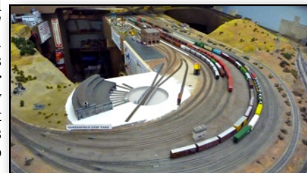
Work is progressing on the new Bakersfield roundhouse and turntable

in getting locomotives into the engine terminal, onto the turntable, and eventually into the roundhouse. Along with that, our oil rigs are moving up and down, and the "flare" is working in oil city. Sadly, our workforce is now down to four people on site, a few work on projects at home which helps somewhat. Want to join us?