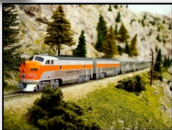
The Western Pacific "Zephyr" climbing the hill to Summit on the N layout during Passenger theme day.

Pacific Day on December 26. At our theme days you can expect to fine many trains representing that day's theme. It's a good chance to see your favorite trains in operation. The photos show some of the highlights from last year.. --Martin Jahner