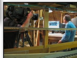
Tracks Ahead crew filming the editor at the O gauge computer center.

lot of time reversing trains to get multiple train pass-bys just right for the cameraman! It was a great experience and