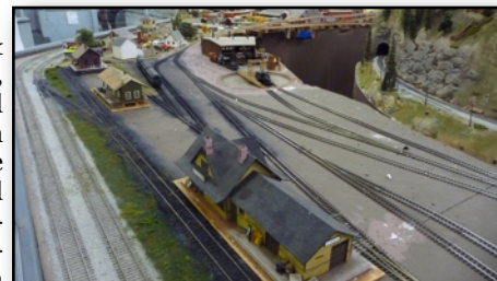
On3 Eureka yard with interchange tracks to SFW.

On the Eureka & Empire On3 layout, the lower Eureka yard was raised to match the standard gauge track levels. Yard trackage and a turntable with roundhouse have been installed. There are also two industries from the SFW Pt. Richmond passenger yard leads.