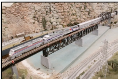
Amtrak theme day action on the O Scale layout.

During the 2010 season we had special trains every 4th Sunday of the month. Some of these included Unit Train Day on April 25, Amtrak Day on May 23, ATSF/BNSF Day on June 27, Steam Day on