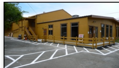
New walkways and outside accessible bathroom.

First, the Parks Department undertook a complete tear down and rebuild of our two bathrooms. These are now compliant with latest building and handicap access codes and feature energy and water saving utilities. One of the bathrooms has outside access