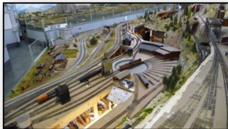
Midway engine terminal with Diesel yard (top center)

During 2010, the O Scale group's major winter time project was the double tracking of Santa-Fe Western block 5 connecting Midway, Arrival, and Departure divisions. The construction, wiring, and panel updates were completed by opening day. The result has been a much improved flow of traffic between the three divisions. Another large project was the re-tracking of the Diesel Yard adjoining the Midway Engine Terminal. There are now inbound, outbound and turntable tracks controllable from either the Midway Engine or Diesel Yard panels. We also added two new industrial spurs in the area. In total, thirteen turnouts were built for these projects.