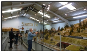
Tracks Ahead film crew working on the O gauge layout.

should enhance our publicity when broadcast sometime in 2011. Thanks to the narrators and crews for enabling this event.-- ed.