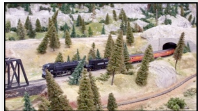
Steam theme day action on the HO layout.

July 25, UP/WP Day on August 22, Passenger Day on September 26, "Foreign to California" Day on October 24, F-unit Day November 28, and concluding with Southern