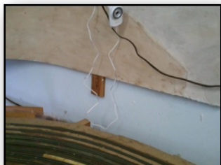
This is what a camera looks like above a yard of N scale track.

The Fireworks Stand's Parking lot is overflowing, six buses, about 18 cars, even a camper (the owner) out back! During the