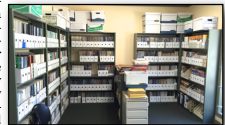
New Library, arranged and catalogued by library manager Mark Francis.

The renovation of the clubroom area included relocating the museum's library to the former meeting room. The room was completely refurbished with new wall covering, additional wall space, and fresh paint. New carpeting was installed and a free-standing desktop added to accommodate two laptop computer workstations. New metal shelving storage units were custom fitted to hold the museum's collections of magazines and books.