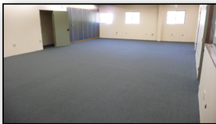
Meeting room after carpet installed.