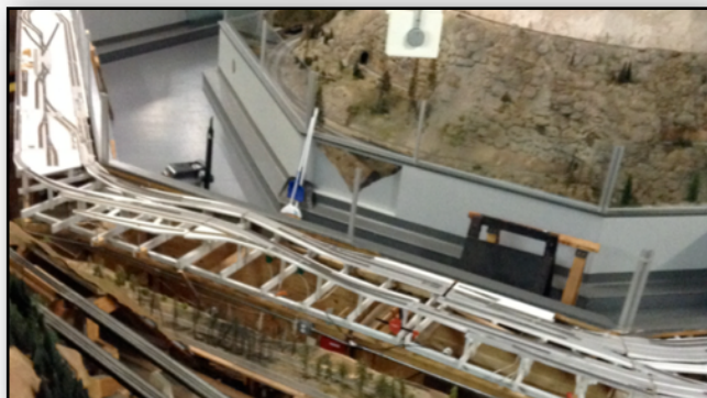
New modules installed in the railroad in January 2016.

we will be testing the new track and installing temporary equipment protection so HO trains can run starting in April.