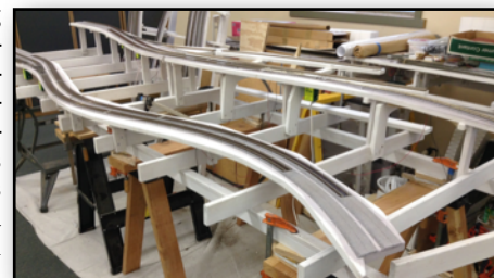
Two of the last modules getting cork, track, Tortoises, and wires added in in GSMRM clubroom.

After creating several workable versions, we began talking about the industrial buildings. A couple of the operations oriented members suggested we take a field trip through parts of Berkeley, Emeryville, and Oakland to see industries that had rail service in the 1950's (even if they do not now) and still have rails embedded in the street.