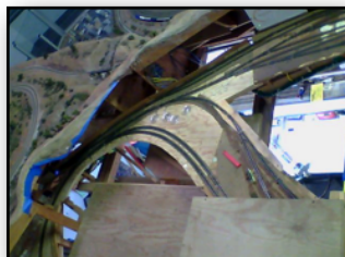
This is what the video looks like on a smartphone screen

winter break, we are "working our fingers to the bone" to make some small changes, here and there.