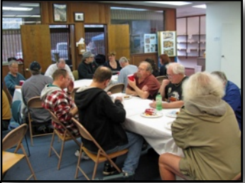
March Potluck and BBQ

As usual, the GSMRM members took a break from winter layout work on March 17th to do the yearly spring cleanup of the outdoor parking and landscape areas. This year we concentrated on cleaning the back storage areas and layouts. Under coordination of